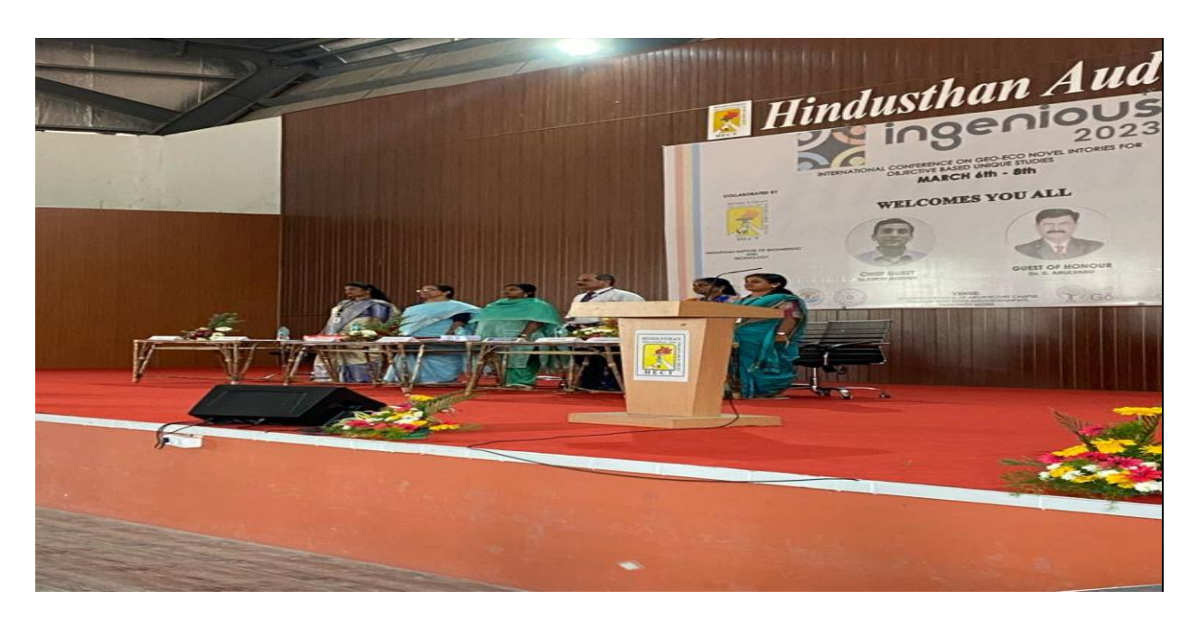
Total no. of Staff (Teaching/Non-teaching) participation: 63